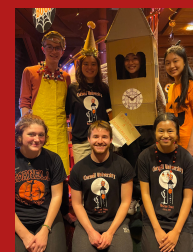
CHIMESMASTERS AT THE HALLOWEEN CONCERT