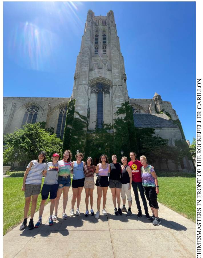
CHIMESMASTERS IN FRONT OF THE ROCKEFELLER CARILLON

This Congress was a wonderful opportunity to introduce our chimesmasters to the bell-ringing community outside of Cornell. The chimesmasters and I are all incredibly grateful to those who made this trip possible through gifts to the Cornell Chimes. The next Congress will be held in Cohasset, MA from June 14-17, 2023. I know we have many chimes alums in the Boston area - we'd love to see some of you there!