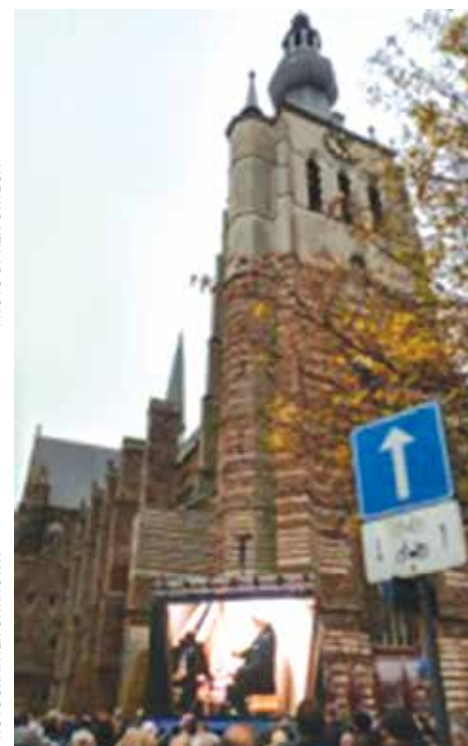
Belgian carillon culture—crowds turn out to hear concerts, often watching the performance via video screen (sometimes with a beer in hand) because the carillon cabins are usually inaccessible to visitors.