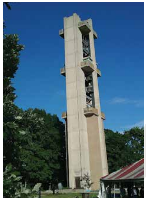
Thomas Rees Memorial Carillon, Springfield, IL