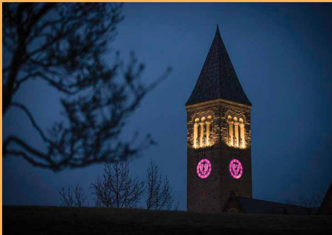
McGraw Tower, dressed for the annual Valentine's Day concert