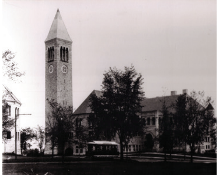
McGraw Tower with trolley.

If you enjoyed this and are yearning for more chimes history (including more recent years), join us for our 150th anniversary celebration in September!