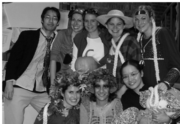
Costumed chimesmasters gather for Halloween fun