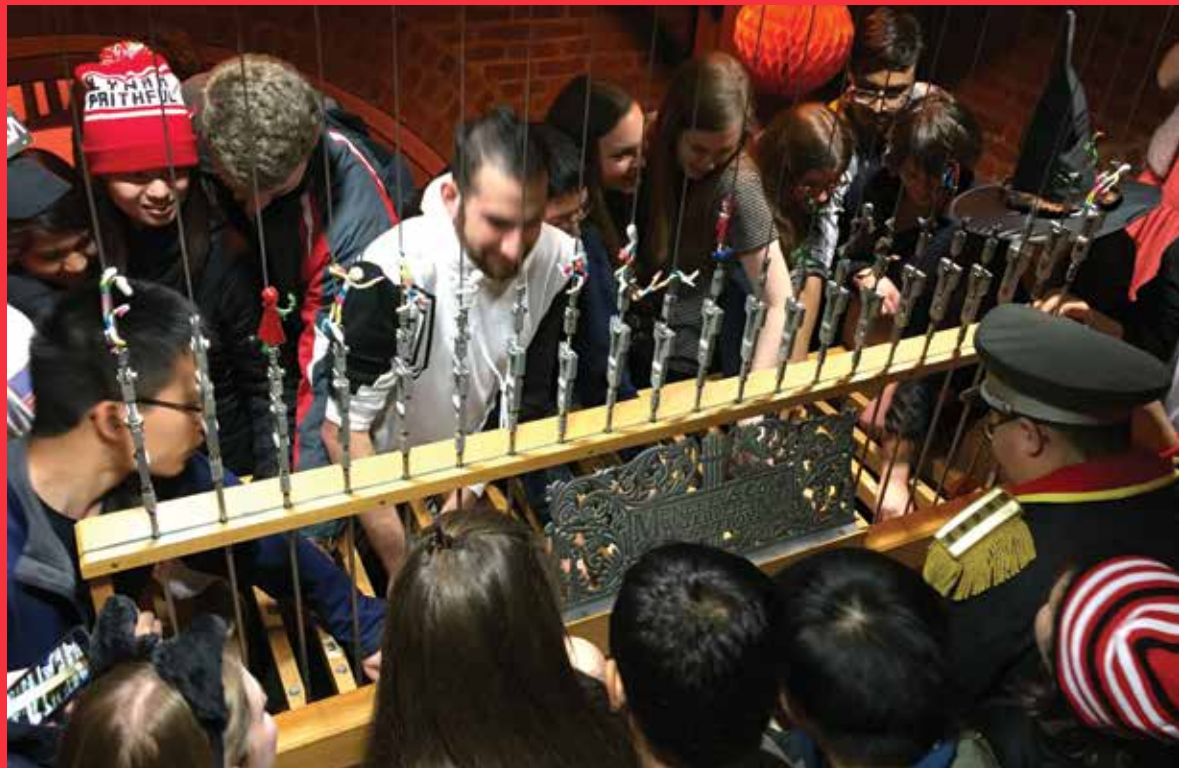
Halloween visitors gather around the playing stand to play the great chord (when all the bells ring out at once at the stroke of midnight).