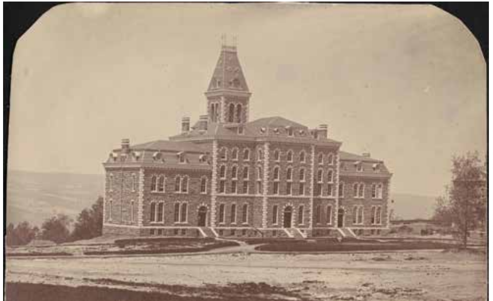
McGraw Hall circa 1875.

Sept. 29, 1869: At the end of an article about the lack of music in Cornell student life as compared to student life at European universities "...When the Trustees deem it